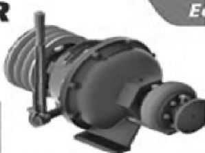
GP 1070 M - 1

Please Contact for any purchase and service enquiry for Gearbox products